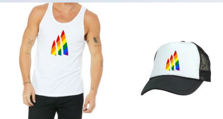
official apparel & merchandise