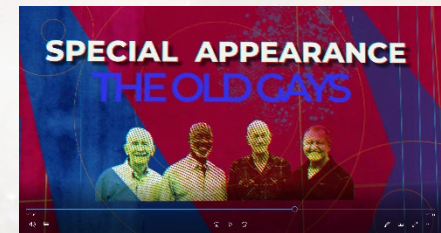
digital paid media promos click to play