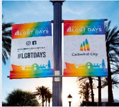
light pole banners Ave Lalo Guerrero

Sponsors and advertisers can take advantage of multiple high visibility branding assets throughout the event venue during all three days of events