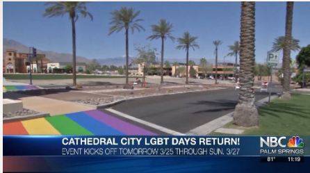
NBC Palm Springs Interview

all sponsors will be included in various campaign elements