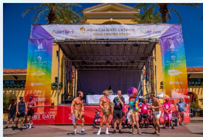
Main Stage & Civic Center Stage Naming Rights & Branding