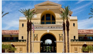
City Hall façade banners/gobos