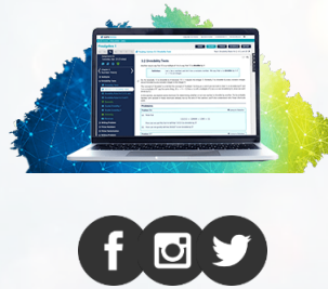
websites & social media posts, stories and paid ads