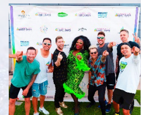
step & repeat