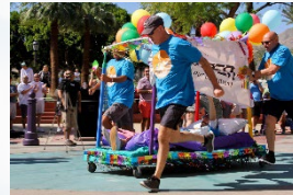
branded Bed Race entries