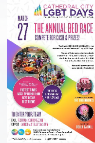
official posters & flyers