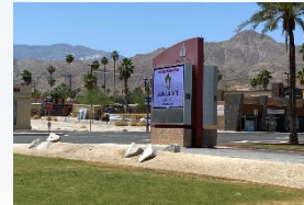
City LED billboard on highway 111