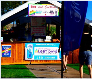
branded bars & vendor tents 10x10 to 20x60