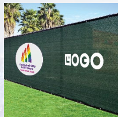
perimeter fence branding